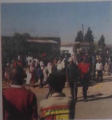
Shop looting in Soweto.

ALSO READ: One shot dead, foreign national shops looted in Soweto violence